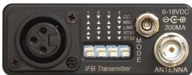
The rear panel provides the audio input and programming DIP switches for intercom and audio input type along with power and antenna input jacks.

The DSP algorithm can operate in the native, compandor-free hybrid mode with Digital Hybrid receivers, or in a compatibility mode for use with IFB R1a receivers. When used with the R1a receiver, the system operates in the analog IFB mode with compandor noise reduction. When used with Digital Hybrid receivers, the system can operate in the compandor-free hybrid mode.